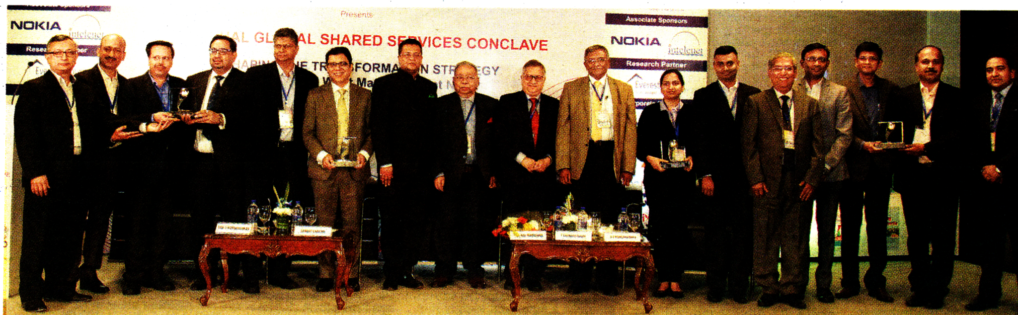
The awards to organisations were conferred upon Olam International (for servicing in overseas markets), Essel Business Excellence Services – Essel Group (for servicing Indian market), Vodafone Shared Services India (for delivering business impact through process excellence), Syngenta Services (for delivering business impact through technology transformation – GIC), Principal Global Services (for delivering business impact by deploying innovative people practices), Unilever Industries (for delivering business impact by moving up the process value chain), Hindustan Coca-Cola Beverages (for delivering business impact by exemplary customer experience management), and Raymond – Lifestyle Business. Shared Services was recognised for effective shared services implementation in India.

The huge success of the 7th Conclave reinforces the belief that success stories of global shared services and adoption of Business Processes in Indian Corporations is the best possible way to disseminate the value of Business Process and Shared Services and their linkage to Business Impact. SSF